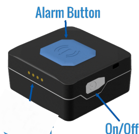
Dimension 44 x 43 x 20 mm