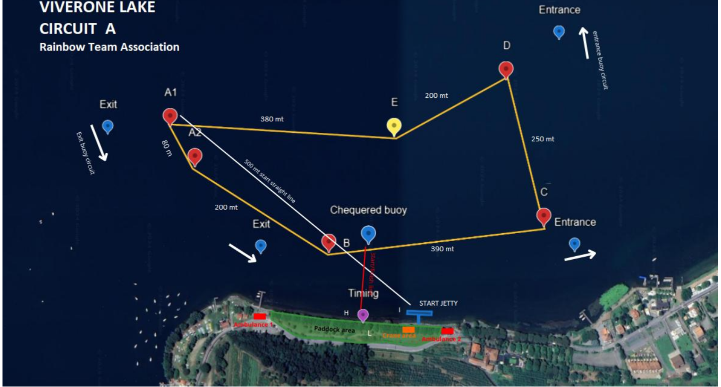
Map of F.Junior Elite race circuit